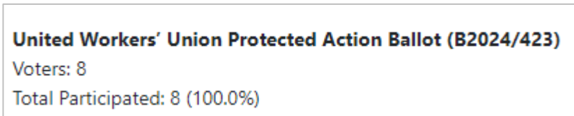
Diagram 1: Final Vote Participation

Final Ballot Audit: Friday, 26 April 2024 at 01.20 pm AWST