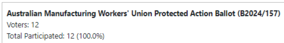
Diagram 1: Final Vote Participation

Final Ballot Audit: Thursday, 14 March 2024 at 11.05am AWST